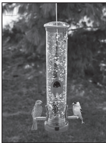
Quick-Clean Seed Tube Feeder with WBU Supreme Blend

Birds tend to choose feeders that are at the same height where they would find food in the wild. Imitating these natural feeding levels will help you attract the most birds to your backyard.