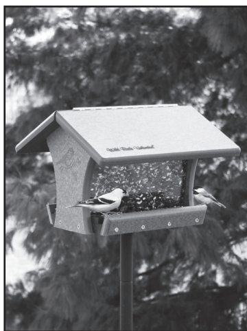
EcoTough Classic hopper feeder with WBU Deluxe Blend

Our WBU Deluxe Blend is full of sunflower seeds, millet and other seeds. Sunflower lovers will eat at the feeder, and ground-feeding birds will eat the fallen millet.